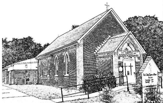
OUR LADY QUEEN OF PEACE CHURCH

Mission: To show the love of Christ through discipleship, fellowship, and worship.