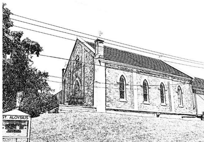
ST. ALOYSIUS CHURCH