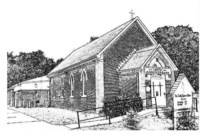
Mission: To show the love of Christ through discipleship, fellowship, and worship.

OUR LADY QUEEN OF PEACE CHURCH 18 NEED STREET, BOBCAYGEON https://ladyqueenofpeacebobcaygeon.ca/