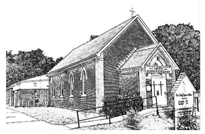
OUR LADY QUEEN OF PEACE CHURCH

Mission: To show the love of Christ through discipleship, fellowship, and worship.